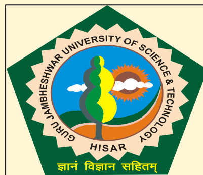
Guru Jambheshwar University of Science and Technology, Hisar- 125 001(HARYANA)